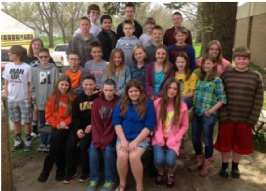
(Pictured: Collins-Maxwell current 6th grade class, future C-M class of 2021)